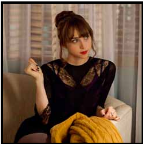
ZOE KAZAN, REGGIE