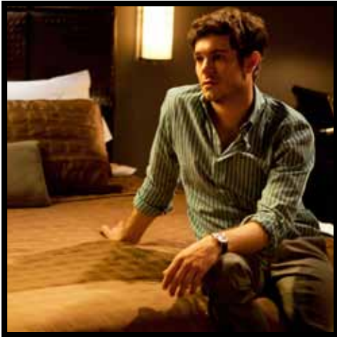
ADAM BRODY, MAN